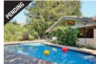
DUDUM REAL ESTATE GROUP