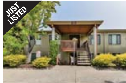
DUDUM REAL ESTATE GROUP