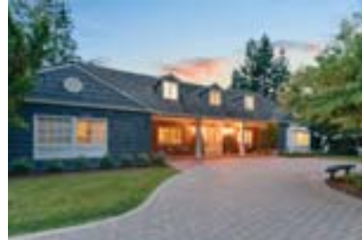
JULIE DEL SANTO/ANGIE CLAY